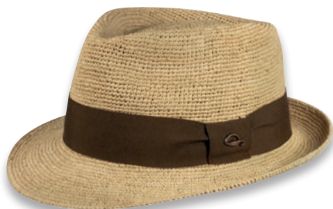
12-371 col. 30 Raffia Crochet