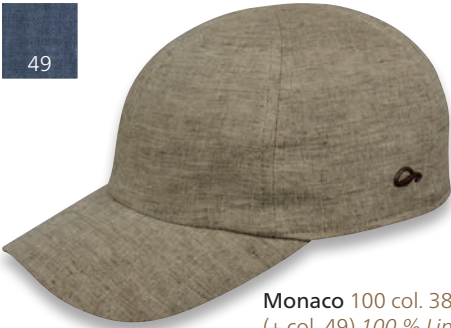
Monaco 100 col. 38 (+ col. 49) 100 % Linen, UPF 40+