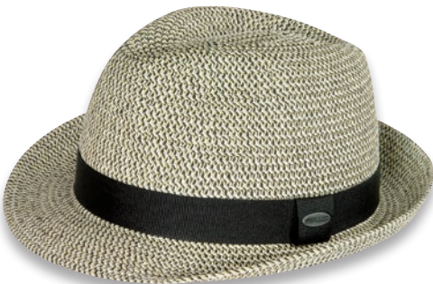
Onyx 22-177 col. 14, UPF 40+