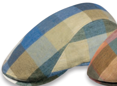
Jackson 611 col. 53 100 % Linen, UPF 50+