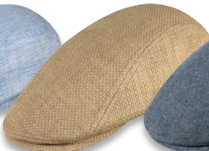
Jackson 22-521 col. 30