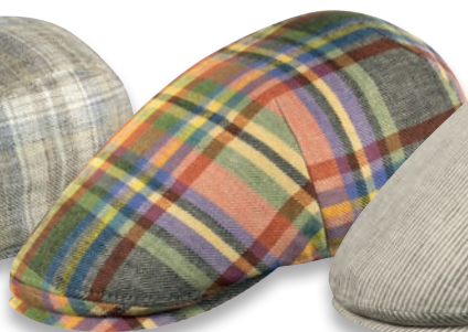
Haywood 743 col. 89 100 % Linen