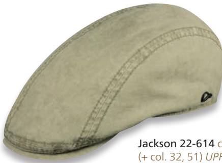
Jackson 22-614 col. 76 (+ col. 32, 51) UPF 50+