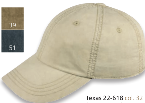
Texas 22-618 col. 32 (+ col. 39, 51) UPF 50+