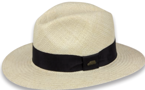
12-162 col. 40, Panama, UPF 50+