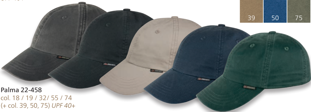
Palma 22-458 col. 18 / 19 / 32 / 55 / 74 (+ col. 39, 50, 75) UPF 40+