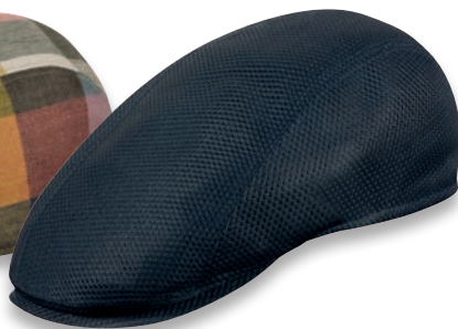
Jackson 598 col. 50 Mesh