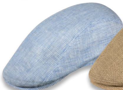
Jackson 22-479 col. 56 100 % Linen