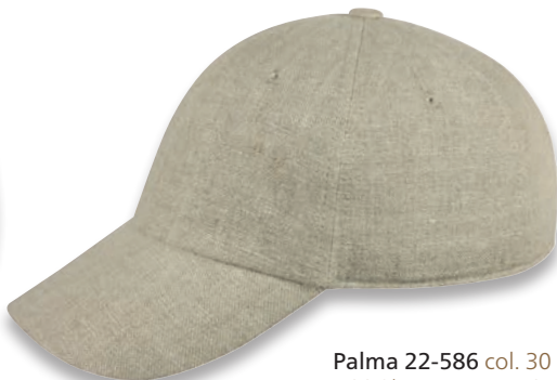
Palma 22-586 col. 30 100 % Linen, UPF 40+