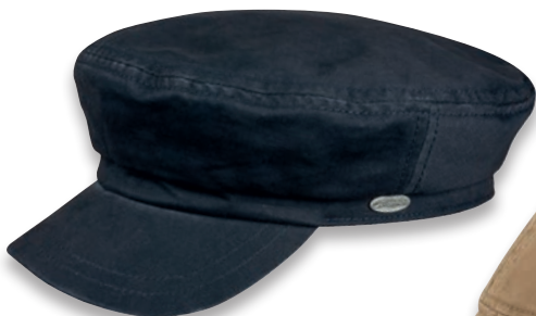
Newport 22-217 col. 55 UPF 40+