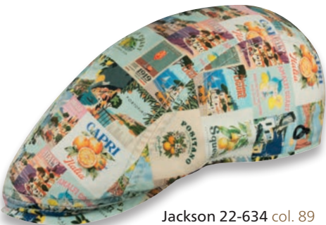
Jackson 22-634 col. 89