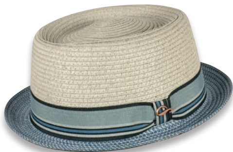
43-10 col. 13