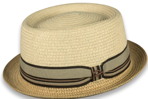
43-10 col. 32