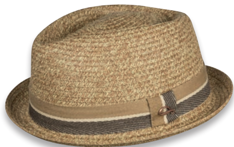
12-384 col. 20