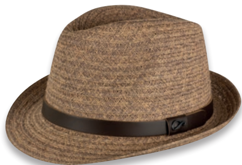
Morris 22-560 col. 28 Raffia