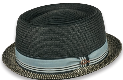
43-10 col. 19