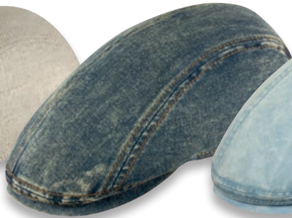
Jackson 22-573 col. 51