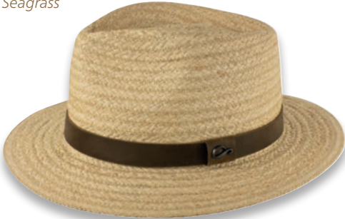
Hemingway 22-563 col. 30 Raffia, UPF 40+