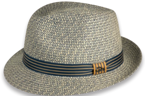
Newman 22-629 col. 58