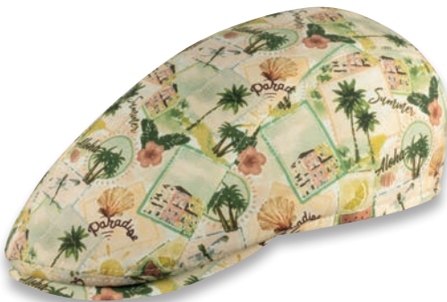
Jackson 742 col. 89, 100 % ORGANIC-COTTON