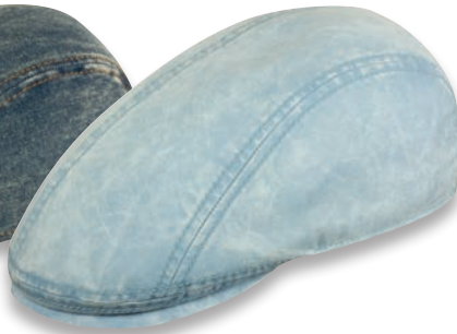
Jackson 22-574 col. 56