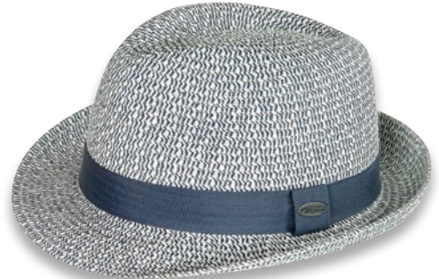
Onyx 22-177 col. 50, UPF 40+