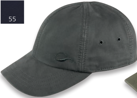
Montana 22-461 col. 18 (+ col. 55) UPF 40+