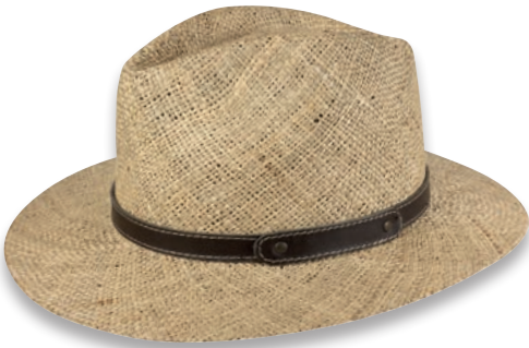
12-299 col. 30 Seagrass