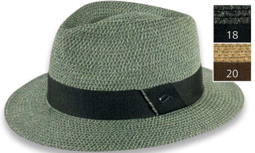
Hemingway 22-597 col. 72 (+ col. 18, 20)