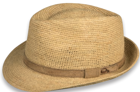
47-06 col. 30, Raffia Crochet