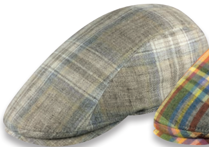
Richmond 744 col. 32 100 % Linen, UPF 40+