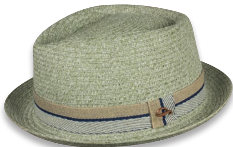
12-384 col. 70