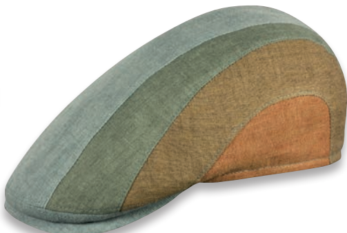
Detroit 100 col. 12, 100 % Linen, UPF 50+