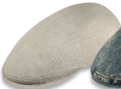
Jackson 22-572 col. 30 100 % Linen, UPF 40+