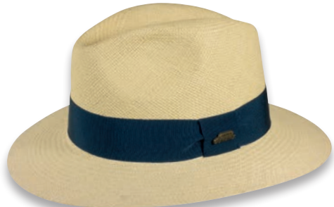
12-162 col. 55, Panama, UPF 50+