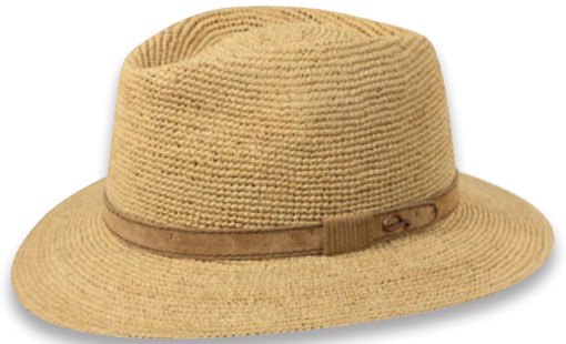
47-04 col. 30, Raffia Crochet