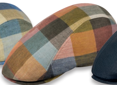
Jackson 407 col. 53 100 % Linen, UPF 50+