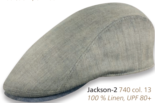
Jackson-2 740 col. 13 100 % Linen, UPF 80+