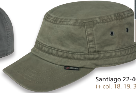
Santiago 22-460 col. 75 (+ col. 18, 19, 32, 55) UPF 40+