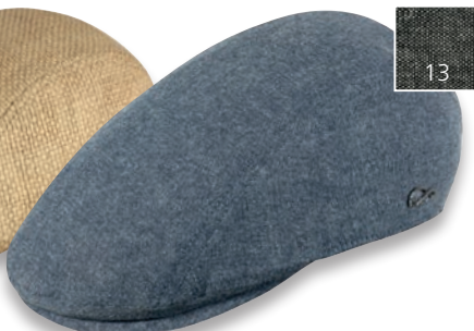
Jackson 22-496 col. 51 (+ col. 13)