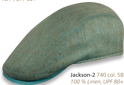
Jackson-2 740 col. 58 100 % Linen, UPF 80+