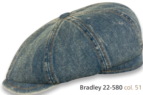
Bradley 22-580 col. 51