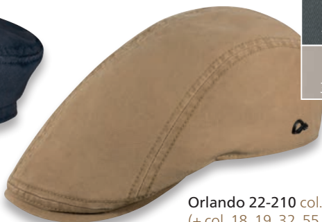
Orlando 22-210 col. 39 (+ col. 18, 19, 32, 55, 75) UPF 40+