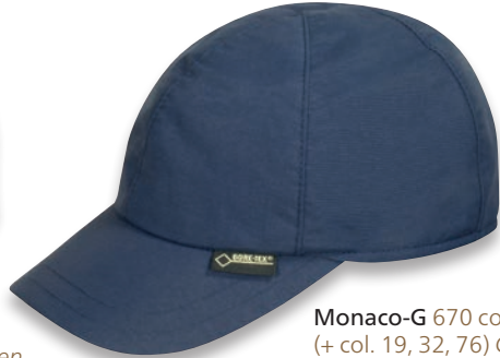
Monaco-G 670 col. 55 (+ col. 19, 32, 76) GORE-TEX®, UPF 80+