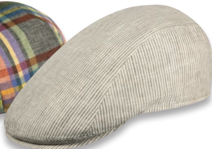
Boston 682 col. 28 foldable, 100 % Linen, UPF 50+