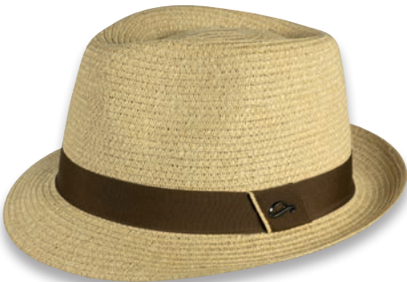
Newman 22-624 col. 30